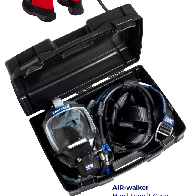
AIR-walker Hard Transit Case

Reference: ISO/TS 16976-2:2015 Respiratory Protective Devices – Human Factors – Part 2: Anthropometrics